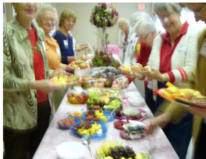
Annual UMW Brunch